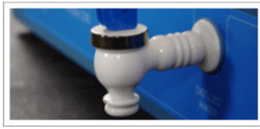
Water still dispenser