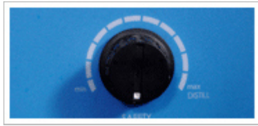
Overheat prevention device