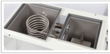
Inside of the unit

This unit offers exceptional value for the user. It is very easy and safe to operate with indicators such as reservoir full indicator, distilling indicator, and with safety device such as overheat safety sensor