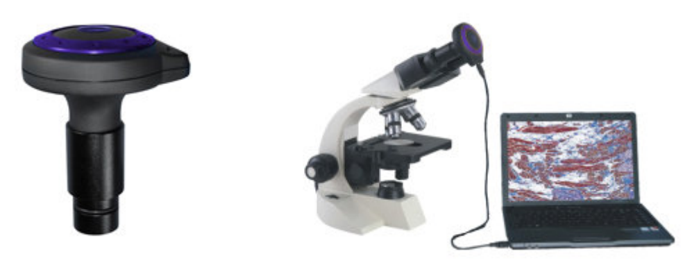
To equip 5.0 MP CMOS sensor and offer enough digital zoom aid for inspecting detailed message of fine specimen when the software attached to capture live image and video in top resolution of 2560*1944, to equip professional matching optical system and insure sharp and true color images, it is available to fit on any kinds of precise and compact microscope stably for its compact structure