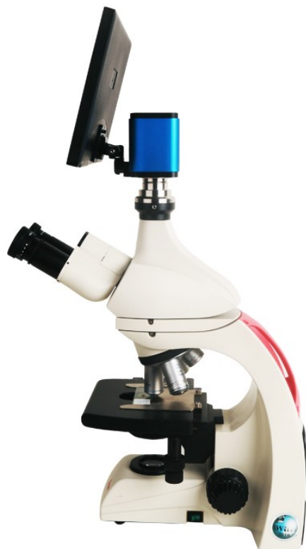
Side View of Leica Microscope+XCAMSeries Camera and TPHD1080PA