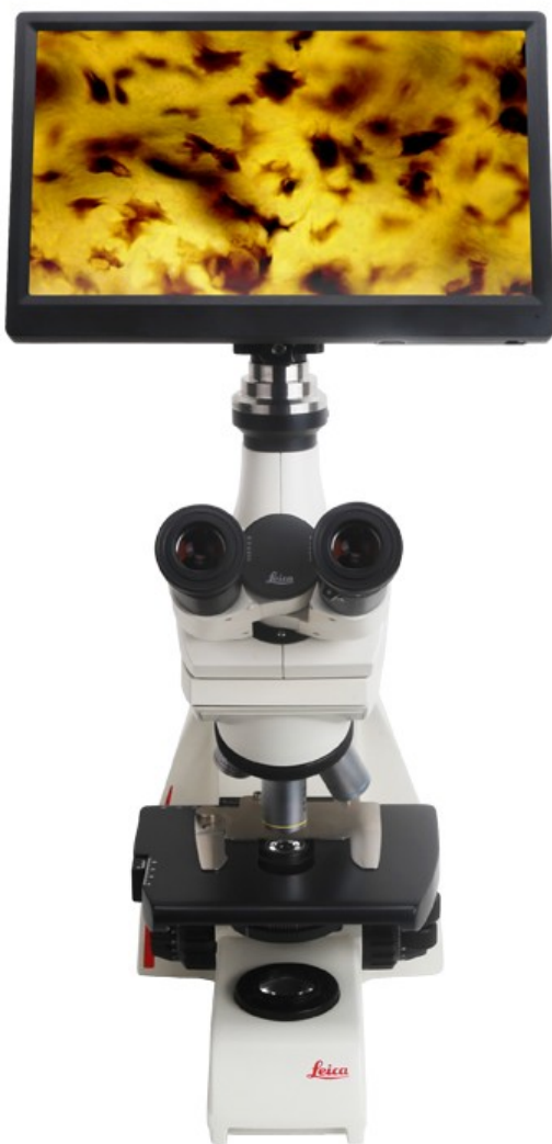
Front View of Leica Microscope +XCAMSeries Camera and TPHD1080PA