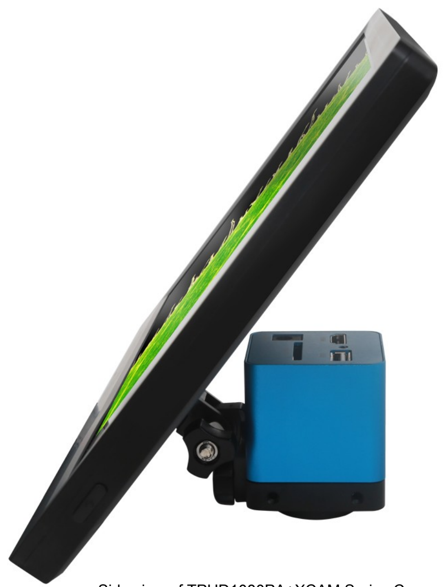
Side view of TPHD1080PA+XCAM Series Camera