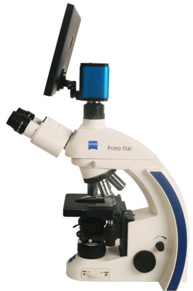
Side View of Zeiss Microscope+XCAMSeries Camera and TPHD1080PA