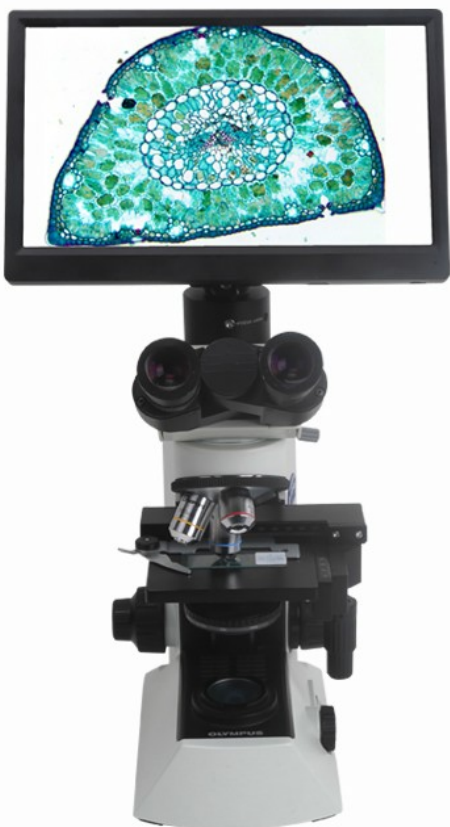
Front View of Olympus Microscope +XCAMSeries Camera and TPHD1080PA