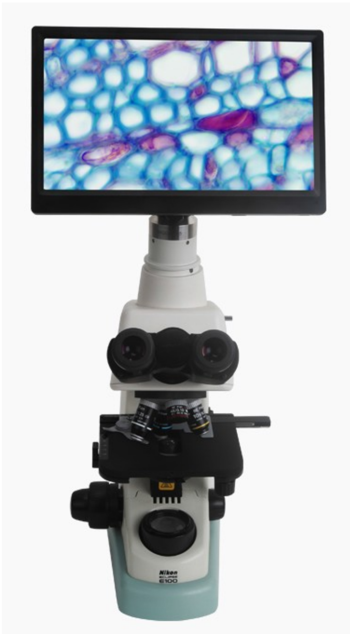
Front View of Nikon Microscope+XCAMSeries Camera and TPHD1080PA