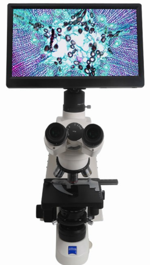
Front View of Zeiss Microscope +XCAMSeries Camera and TPHD1080PA