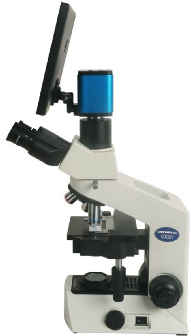
Side View of Olympus Microscope+XCAMSeries Camera and TPHD1080PA