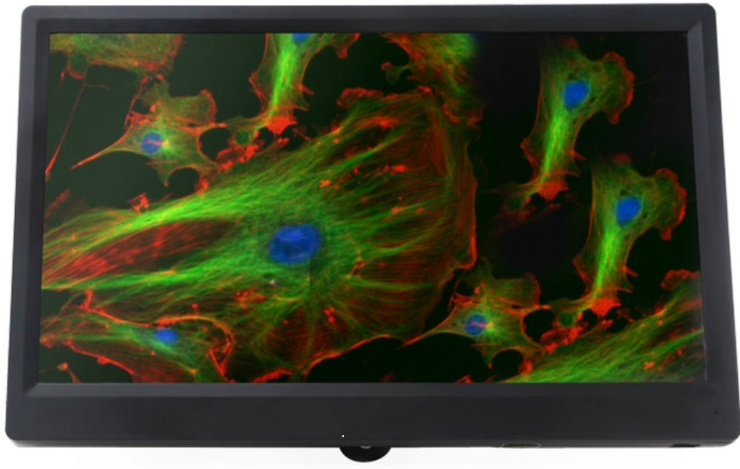
TPHD1080PA and XCAM0720PHB Camera