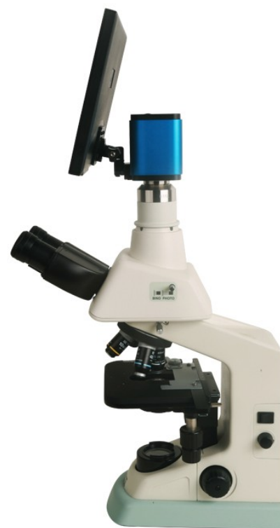
Side View of Nikon Microscope+XCAMSeries Camera and TPHD1080PA