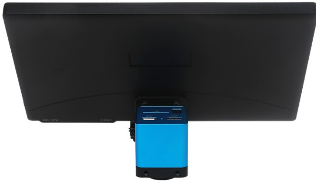
HDMI Displayer for XCAM Series Camera Back View