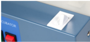
Safety device (Stop for opening)

Use This product is used for cultivation and shaking test of circle movement .