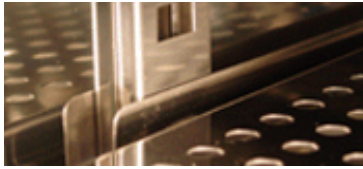
The shelves easy to move