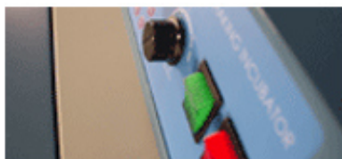
Power & Safety controller