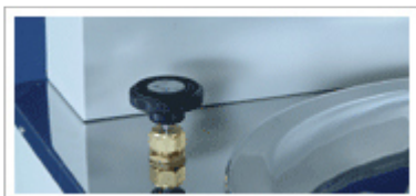
Manual safety valve

Use : This product has a various applications such as sterilizing culture medium, glassware, metal instruments, and disposables