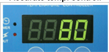
Easy Temp. control