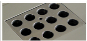
Accurate temp. control.