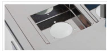
Viscosity install hall